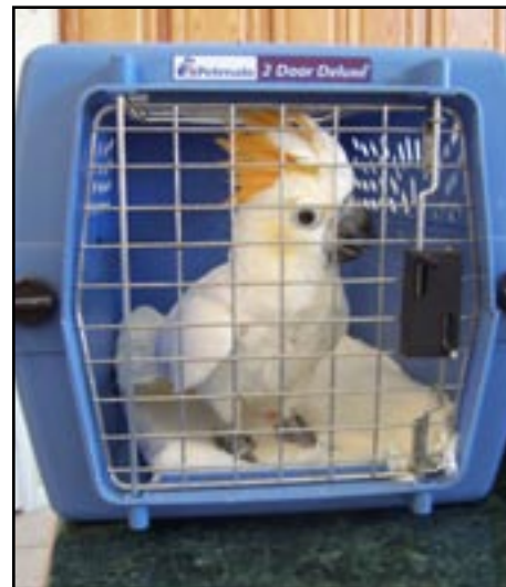
Practical behaviors such as comfortably sitting in a kennel can be trained with positive reinforcement

Surprising to most, training with positive reinforcement is relatively simple. As with any skill it can be practiced. The more it is practiced, typically the better one becomes at its application. Many behaviors can be trained in one or two twenty minute training sessions. The following are a few terms that are helpful to know prior to delving further into the nuances of training with positive reinforcement.