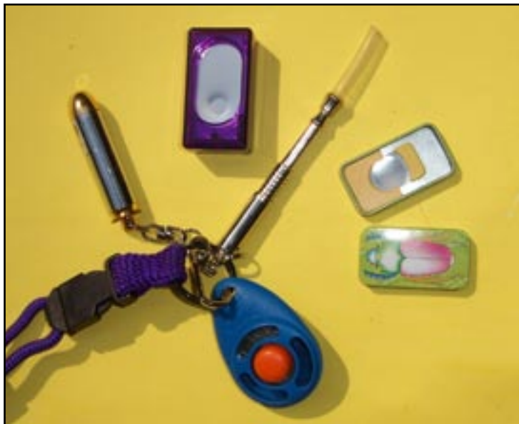
Some examples of bridges are clickers, whistles, the word "good" or a touch.

trainer and the bird. The bird may take a few steps or approximations forward, but if the bird is hesitant to move forward more, the trainers may choose to accept a step that had been mastered previously. The training may remain at this step for a few repetitions as the bird gains confidence before a more challenging step is attempted again. There is a constant shifting and adjusting to meet the capabilities of the bird, but eventually more steps are taken forward then backward and the bird learns what the trainer is trying to teach. It is an intricate dance and one that makes training such an interesting activity. It challenges a trainer's skills. Very rarely does training become boring. Each species, each individual, each behavior brings a new set of criteria to the table.