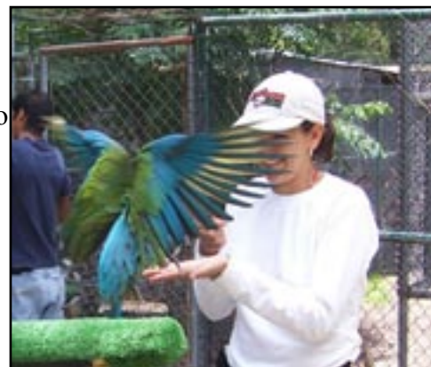
A hand cue signals this macaw to fly to the trainer.

Shaping a behavior with approximations: Once a desired behavior is identified, it is possible to look at that behavior as a series of small steps. The first step must be learned before moving on to the next step. Eventually all the steps when joined together lead up to the final desired behavior. Approximations are used quite often to train behaviors. This strategy can be used to train a bird to step up onto the hand, go onto a scale, step onto strangers, enter a kennel, wave and much more.