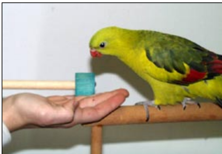
Targeting is an easy behavior to train that can later be used to facilitate training other behaviors

All over tactile exam Cloacal sampling Choanal sampling Ultrasound Radiograph Cloacal temperature reading Nebulization Masking for anesthesia Blood draws